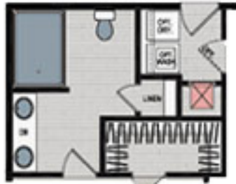
UTILITY/PRIMARY BATH 2. w/ FREE STANDING TUB